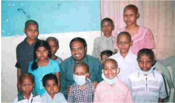
Visiting children with cancer