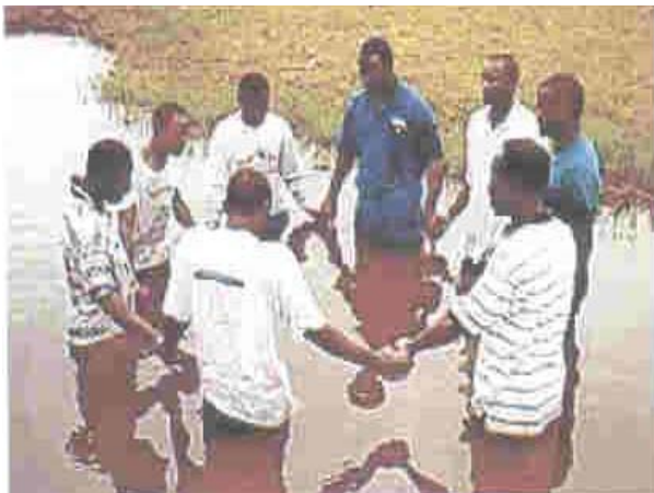
Baptism in Chad

Pray that God will give the twelve newly baptized Barma believers boldness to share the Christian faith with their own people. Take authority over the spiritual principalities and powers that are keeping the Barma bound. Ask God to raise up prayer teams who will begin breaking up the soil through worship and intercession. Christian schools, clinics and social services will help bring many to Christ. Ask the Lord to spiritually equip the newly established Barma Church for the glory of His name!