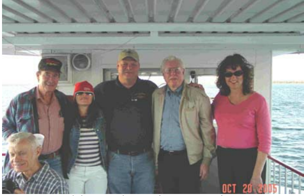
Double Decker Dinner Cruise